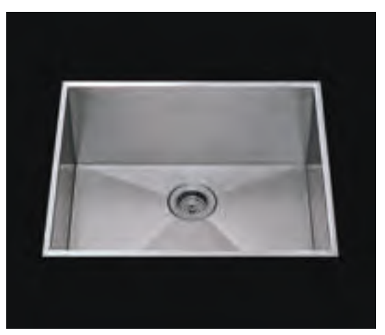
*Flush-Mount Installation Kit is included with each sink *Custom ADA compliant versions are available